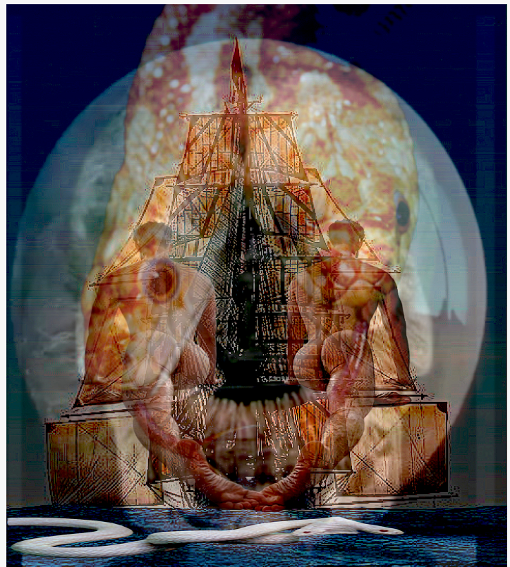
Armada-Cabal-Cortez--Skull-Two-headed-Albino-Snake MBF-Lifestyle NFT