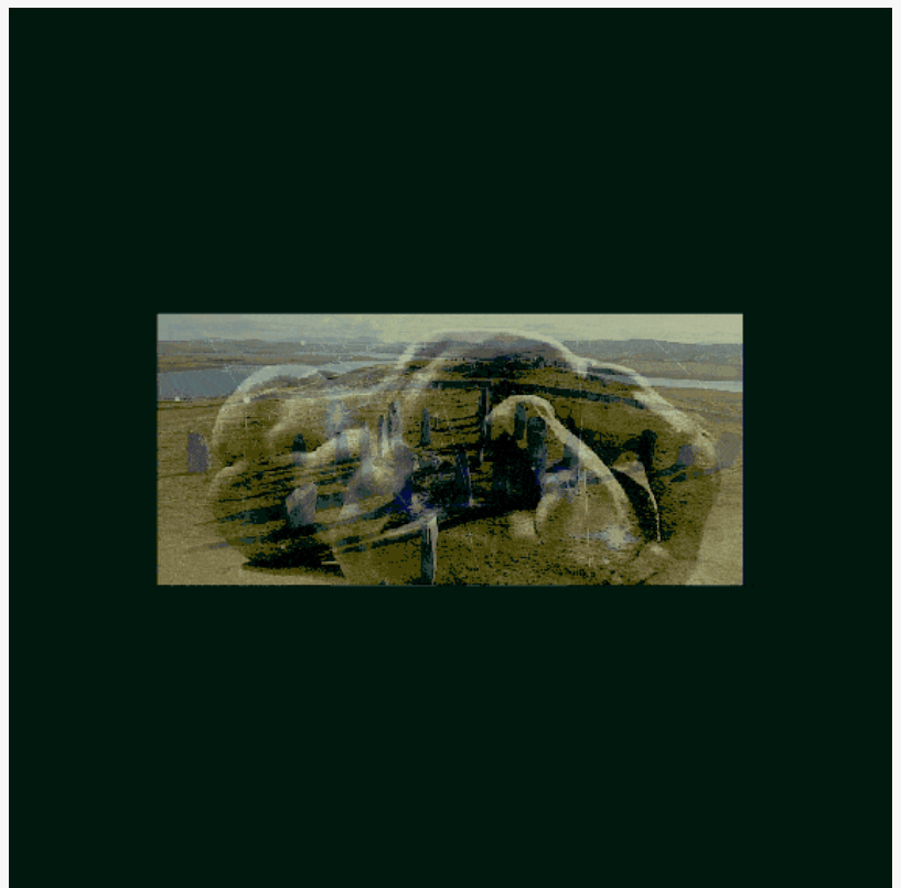
3D-Reduced-Sleeping-Monolith -Giant No Mans Sky MBF-Lifestyle NFT Designs

Nothing new it's the same script, only the media means and stories told have changed.