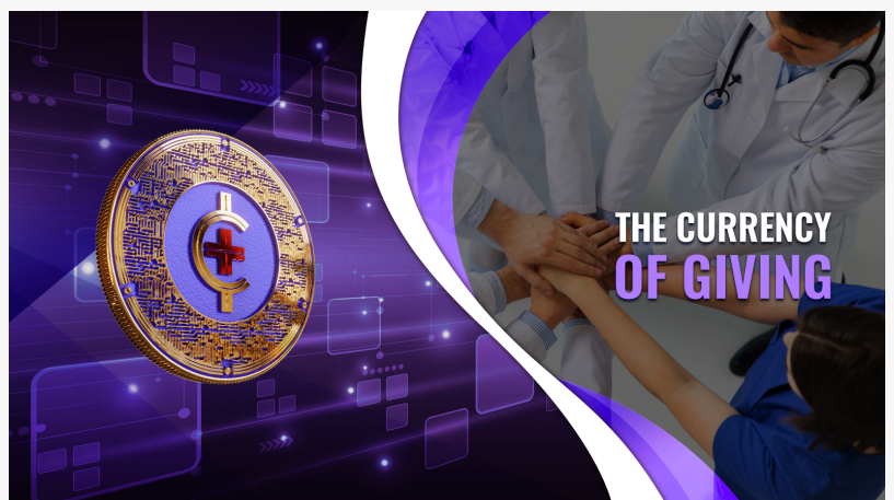
CareCoin; The Currency of Giving

According to the developers, a decentralized financial system doesn't just offer transparency and lower cost cross-border payment options but also presents the unique opportunity for everyday people to leverage the strength of their massive transaction volume to make positive impacts all over the world.