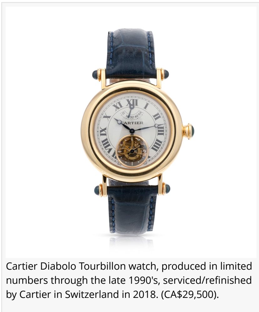
Cartier Diabolo Tourbillon watch, produced in limited numbers through the late 1990's, serviced/refinished by Cartier in Switzerland in 2018. (CA$29,500).

A rare Tudor (Ref. 7928/0) Oyster-Prince Submariner watch, produced only in 1967, with an open