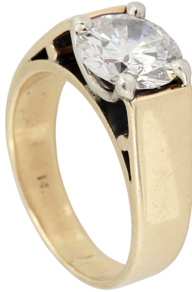
14kt gold lady's combination cast and assembled four-prong solitaire ring with a bright polish finish and one basket-set round brilliant cut diamond weighing 2.82 carats (CA$15,340).

This press release can be viewed online at: https://www.einpresswire.com/article/557539144