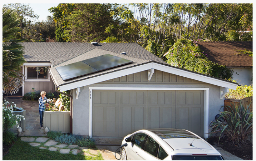
Mirasol Residential Solar Installation

keep up with the trend. If you or someone you know is looking for a stable career as a technician or installer in the solar industry, contact us mirasolsolar.com/careers