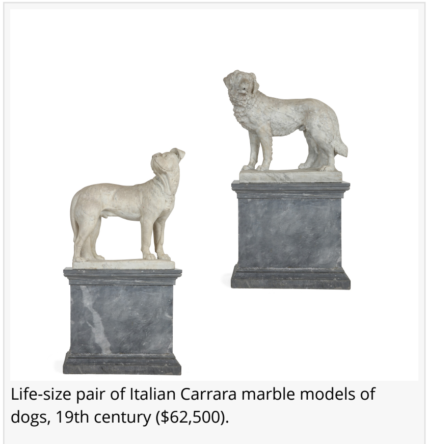
Life-size pair of Italian Carrara marble models of dogs, 19th century ($62,500).

All prices quoted in this report are inclusive of the buyer's premium.