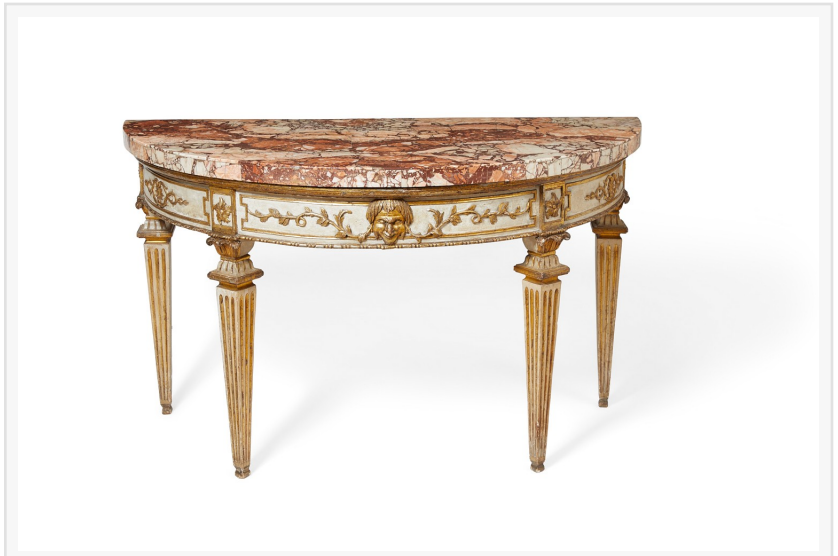
One of a pair of Florentine Neoclassical parcel gilt and white painted demilune console tables, circa 1800 ($30,000).

Aileen Ward Andrew Jones Auctions +1 213-748-8008 email us here