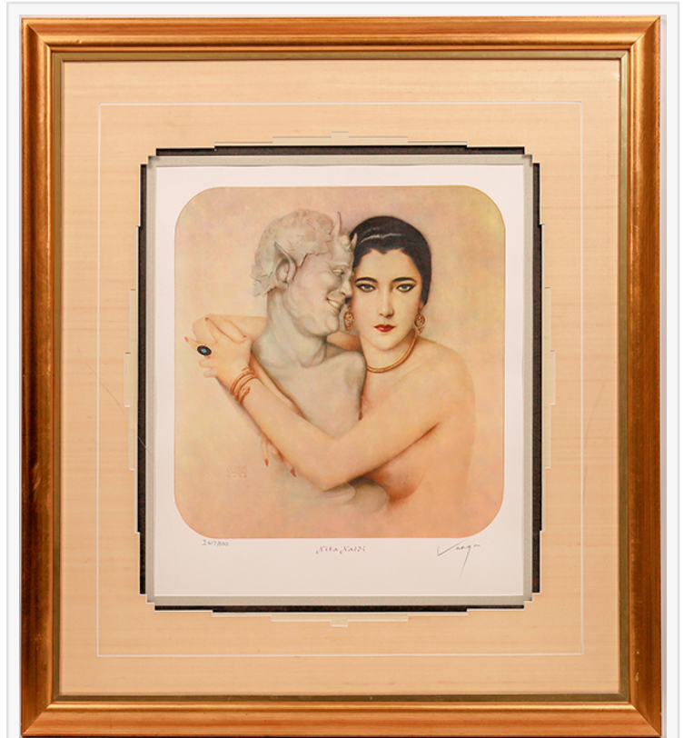
Signed print of 1920s actress Nita Naldi by the iconic American artist Alberto Vargas (estimate: $3,500-$5,000). Signed prints by Vargas are very rare.