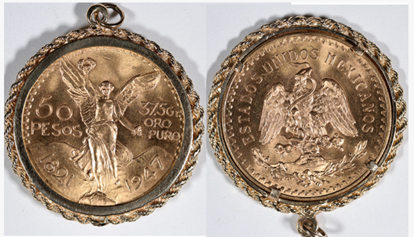
50-peso Mexican gold coin from 1947 (90 percent pure gold) with a 14-carat bezel (estimate: 2,600-$3,000).