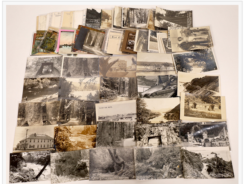
Collection of Humboldt and Del Norte counties (Calif.) postcards, showing the NorCal redwoods scenery along US 101, about 125 pieces (estimate: $300-$600).

Other Day 2 offerings will feature a Haag Bros. Circus poster (date unknown), printed on heavy canvas measuring 29 inches by 44 inches and boasting vibrant colors (estimate: $1,000-$4,000); a Civil War-era Bowie presentation knife made in Sheffield and used by the 9th Corp under Gen. Ambrose Burnside, acid etched "Victory to Our Brave Volunteers" (estimated: $2,000-$3,000); and a beautiful 14-18kt gold Art Deco style brooch with multiple dangling ornamentation and a central clear faceted stone, in a burgundy velveteen drawstring bag (estimate: $1,500-$2,500).