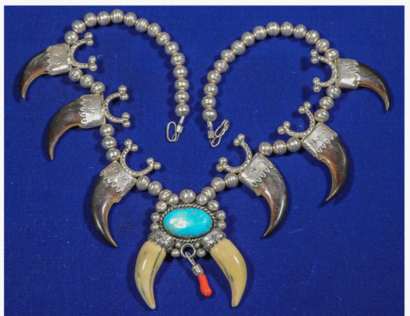
Hollow silver bead necklace with six bear claws capped with silver adornments, plus a central turquoise cabochon set in silver (estimate: $2,000-$4,000).

Other Day 2 star lots will include the 1886 edition of The History of California in 23 volumes by