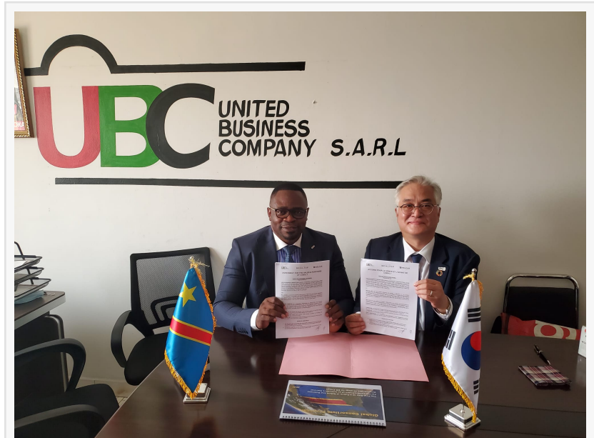
Mealtop & UBC Signing Agreement

Under this present contract, Mealtop will receive a total of 1.52 billion USD (Cobalt 945 million