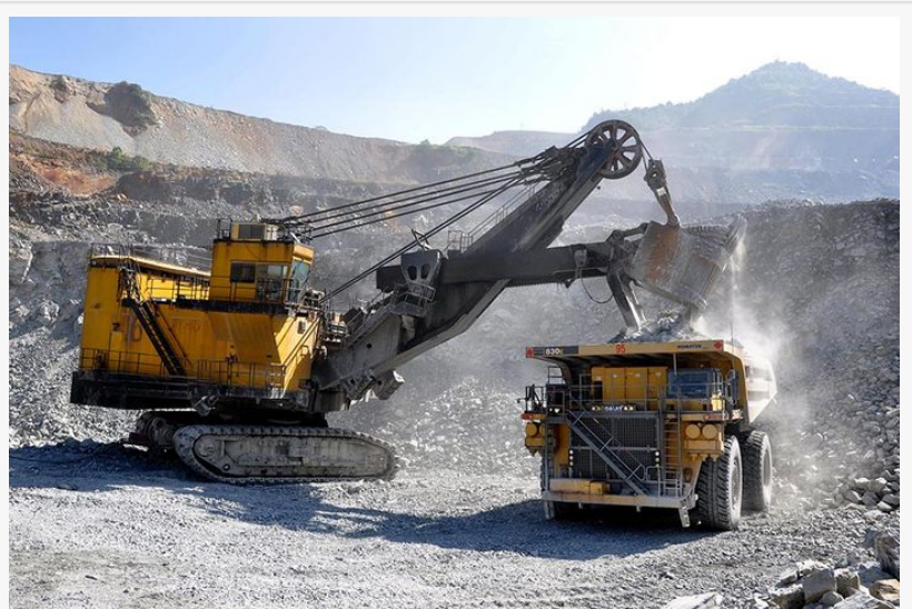
DR Congo Mining

Indeed, it is worth to keep eyes on them carefully whether Mealtop's efforts over the years will