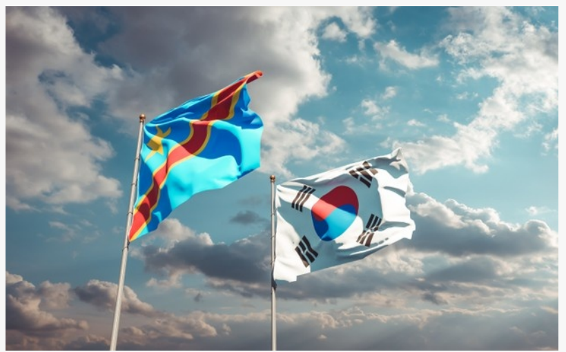
The Democratic Republic of The Congo and South Korea

USD, Copper 575 million USD) worth of cobalt and copper finished products from UBC over the next three years. The scale of finished copper products to be supplied by 2024 will be 6,000 tons of cobalt per year for a total of 18,000 tons across the 3 year period, and 20,000 tons of copper per year for a total of 60,000 tons across the 3 year period. Mealtop aims to receive finished products of cobalt and copper from UBC as early as December 2021.