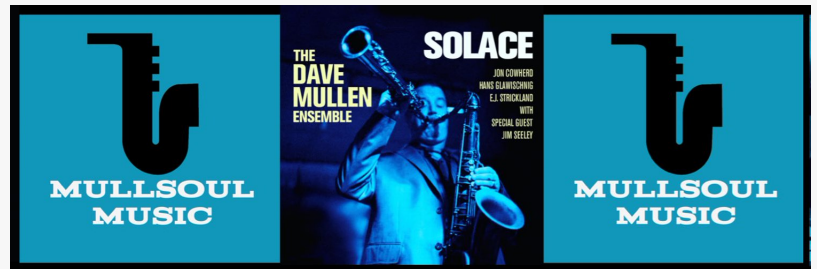
Solace on Mullsoul Music Records

This press release can be viewed online at: https://www.einpresswire.com/article/549377248