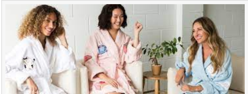
The Applique Collection in the original heritage styles.

Now, the brand has earned its recognition in the industry and become known for its creative prints and patterns, seen notably in the iconic Applique collection, and is recognized worldwide. The company works meticulously to provide the finest products with the best prices, all while maintaining exceptional quality, service, and attention to detail. Creating new fabrics and products has been Aegean Apparel's top priority since the beginning. They are constantly developing their product line of apparel, pajamas, loungewear, and bathrobes, and are consistently expanding to add more exciting styles without ever compromising quality, price, or service.