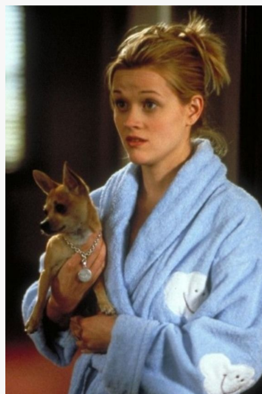
Happy Cloud Applique Short Terry Loop Bathrobe seen here on Reese Witherspoon as Elle Woods in "Legally Blonde".