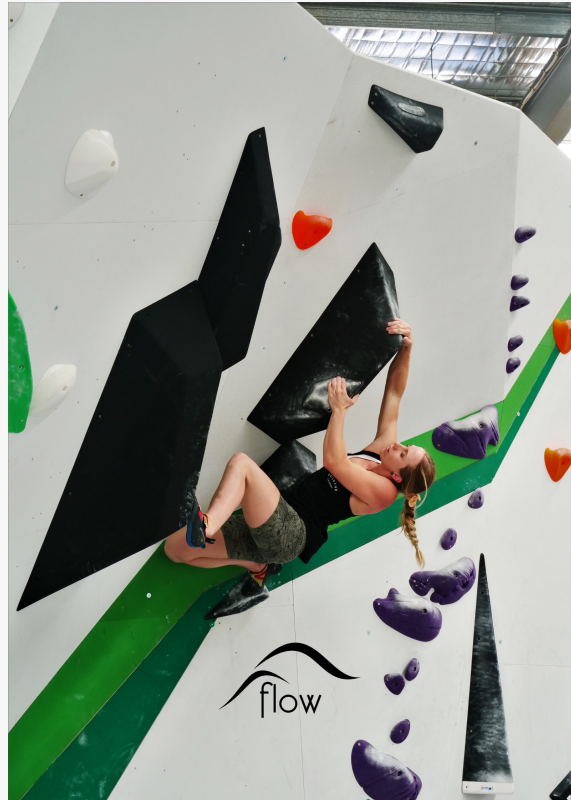
Elite athletes compete in State Championships this weekend at Flow Bouldering Forest Glen Sunshine Coast

In sport climbing, athletes compete in three disciplines including bouldering,