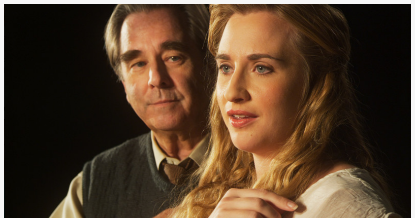
Beau and Emily Bridges

"It is such an honor to accept the President's Innovation Award at the Burbank International Film Festival this year. Acting: The First Six Lessons was a labor of love, and I can't wait to share