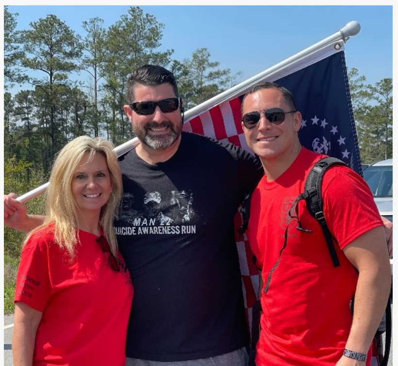
Axios Investigations Firm CEO Carrying Flag