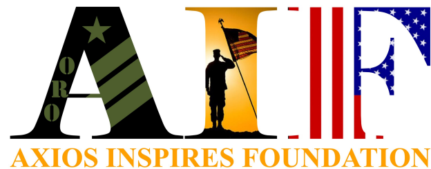
Axios Inspires Foundation Logo