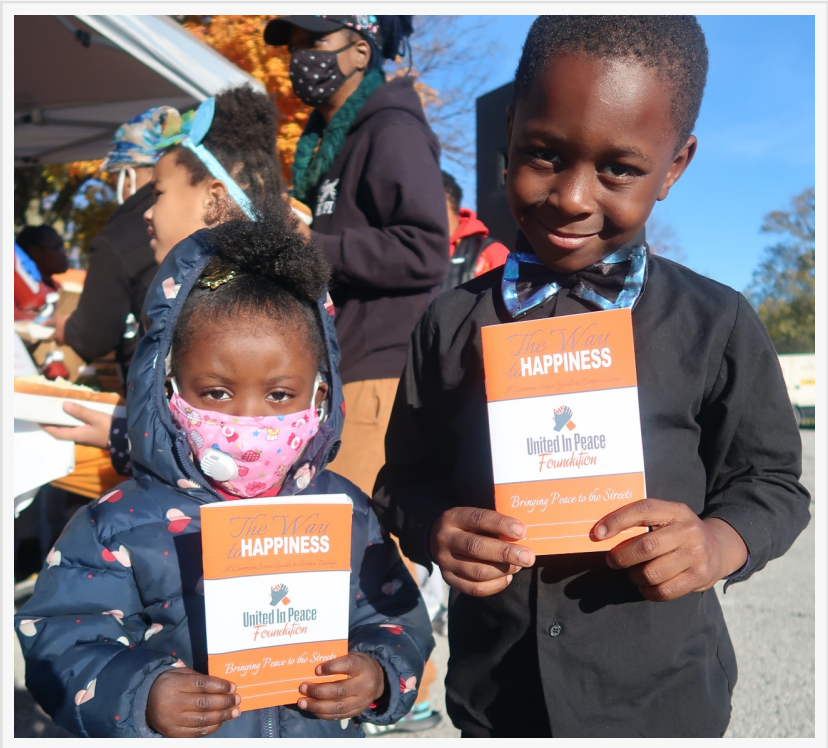
The Way to Happiness is a common-sense guide to better living used to quell riots and civil disorder and bring warring gangs together in the name of peace.

Media Relations Church of Scientology International +1 323-960-3500 email us here