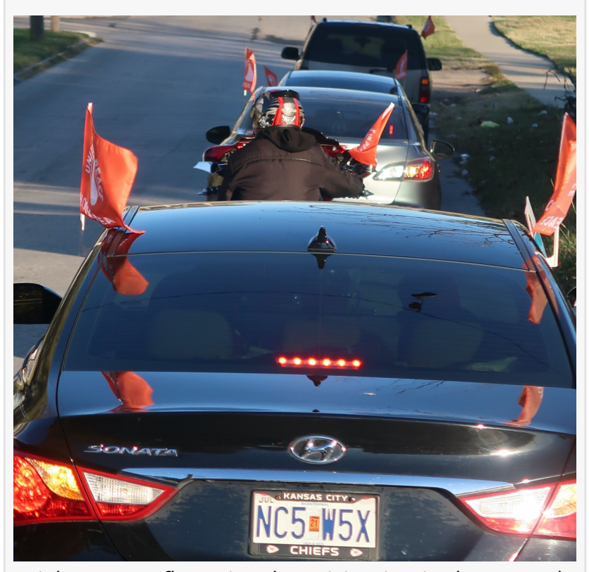
Bright orange flags signal participation in the second bimonthly KC Peace Ride.

together to bring peace to our inner cities. Law enforcement and government leaders have recognized and acknowledged reduction in violence and crime rates in neighborhoods touched by the Peace Rides. In Compton, California, the mayor and city council said, "the presence of the Peace Rides in the City of Compton not only inspired residents to come together in the name of peace, but each ride has also immediately preceded statistical drops in crime."