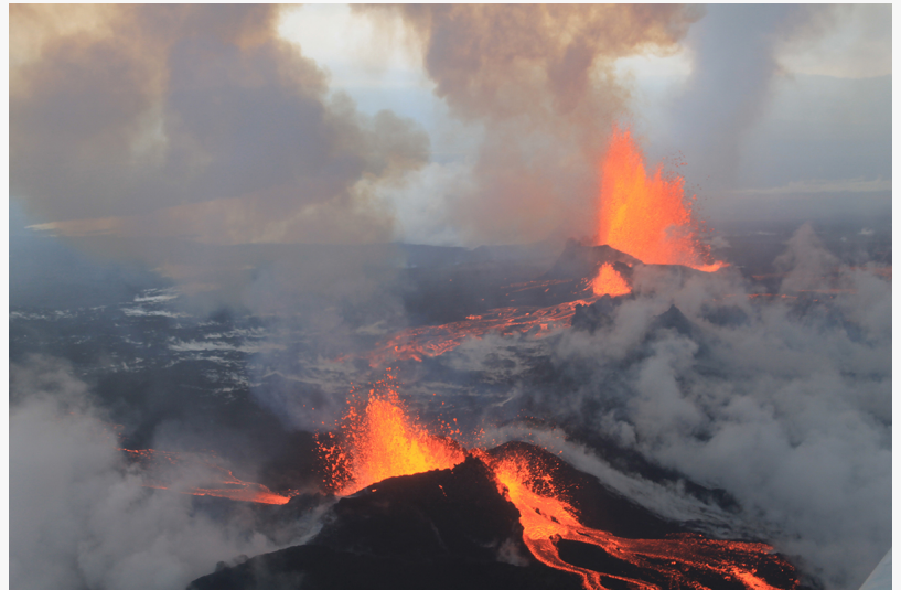
The Bárðarbunga basaltic eruption in 2014-15 covered 33 square miles of land in central Iceland.

The greatest volcanism (red) was contemporaneous with the greatest temperature (black) at the end of the last ice age.