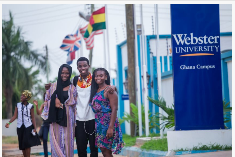
Webster University Ghana Students

/EINPresswire.com/ -- The education industry, like the majority of industries in the world, has been greatly impacted by the coronavirus pandemic. This period has been particularly difficult for international students including those from Africa, pursuing degrees at US institutions, whose immigration, visa status, and educational programs have been left in limbo. In July 2020, the United States Immigration and Customs Enforcement (ICE) announced its decision to deport students who were in the country for educational purposes but unable to attend in-person classes since most universities had switched to online learning.