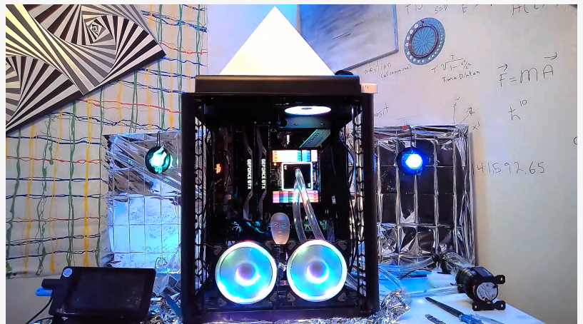
Hypercube Algorithmic Language Oracle