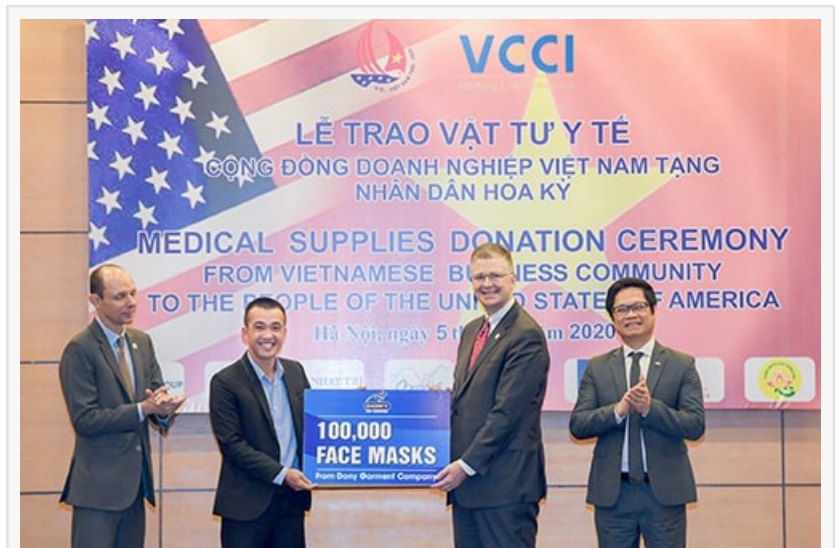
Dony Garment Company along with other Vietnamese enterprises donated medical supplies to the US

/EINPresswire.com/ -- The Vietnamese deal in Sweden recently reported that it had received information from a Danish company about some Vietnamese companies using CE (certificate required by the EU market) issued by organizations. are not recognized by the EU to export medical equipment and supplies to the EU. There are signs of uncontrolled quality