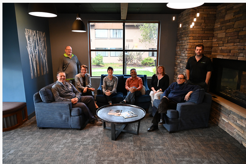
2019 Accelerator Participants

This press release can be viewed online at: https://www.einpresswire.com/article/521876059