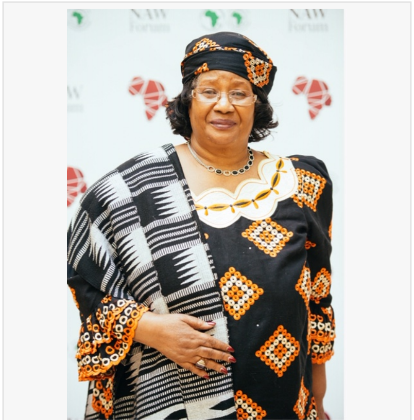
President H.E. Joyce Banda, Global Legacy Person of the year.

I Change Nations is a Culture of Honor System , the organization is committed to bringing back the lost art of honor by building a Culture of Honor that recognizes individuals throughout the