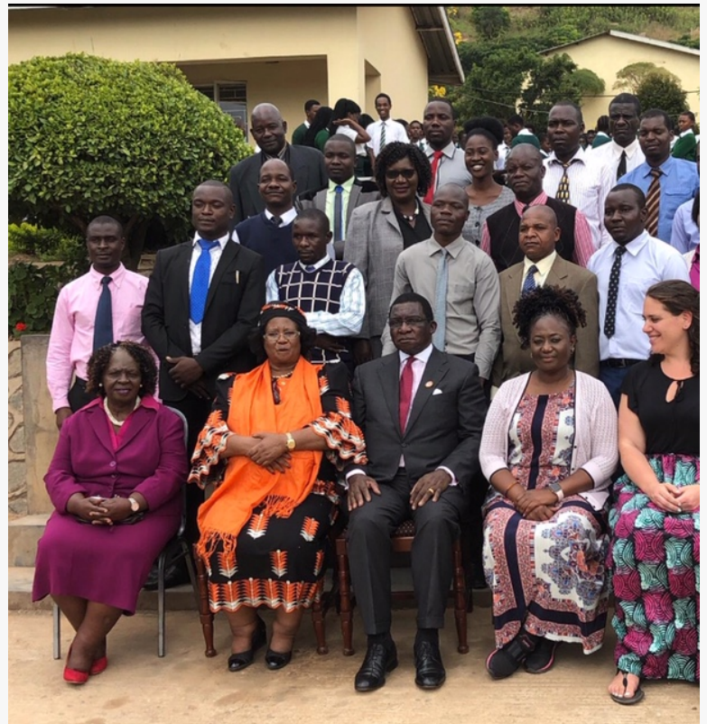
President H.E. Joyce Banda At One Of Her Schools