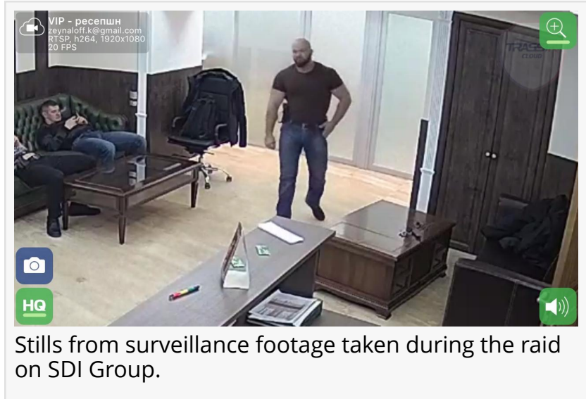
Stills from surveillance footage taken during the raid on SDI Group.