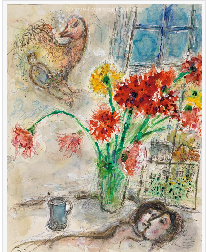
Marc Chagall, Lovers in Bouquet of Dahlias , 1971, watercolor, tempera, pastel, color pencil and pencil on heavy vellum paper, image size/ 24 x 19

Also included in the exhibition is " Lovers in Bouquet of Dahlias ," a watercolor created in 1971 with, tempera, pastel, color pencil and pencil on heavy vellum paper. Chagall's originality lay in his very personal synthesis of the influences he seized on from all sides.