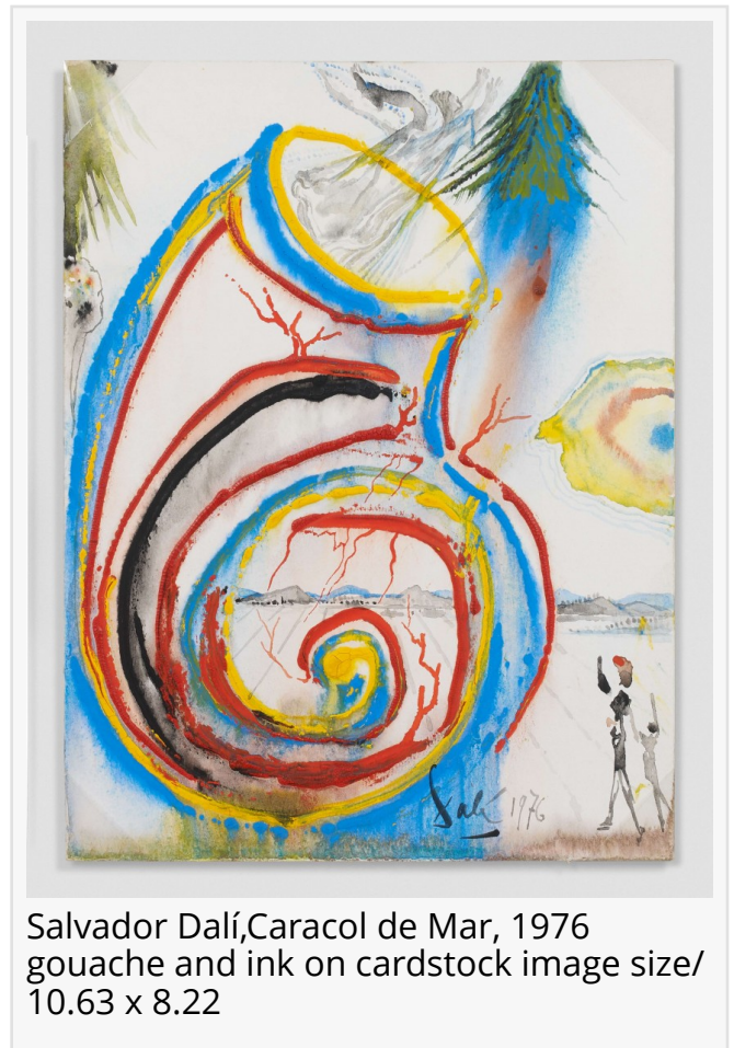
Salvador Dalí, Caracol de Mar, 1976 gouache and ink on cardstock image size/ 10.63 x 8.22

The Corps Perdu series was created by Picasso to illustrate Aime Cesaire's book of poetry Corps Perdu (The Lost Body), published in 1950. Picasso, however, also knew Cesaire personally. Picasso and Cesaire met at the World Congress of Intellectuals for Peace in 1948. They discovered a shared interest in politics, art, and some of the ideas underlying surrealism—namely, the idea of a powerful unconscious mind. Picasso's illustrations in Corps Perdu strive to find the intersection of the African diaspora and Picasso's art. The engraving with burin was used by printmakers to create sharp, crisp lines on the etching plate, which translated into the same on the printed image.