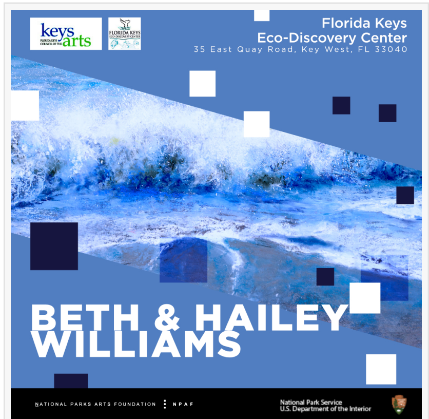
SQ format image for EVENT