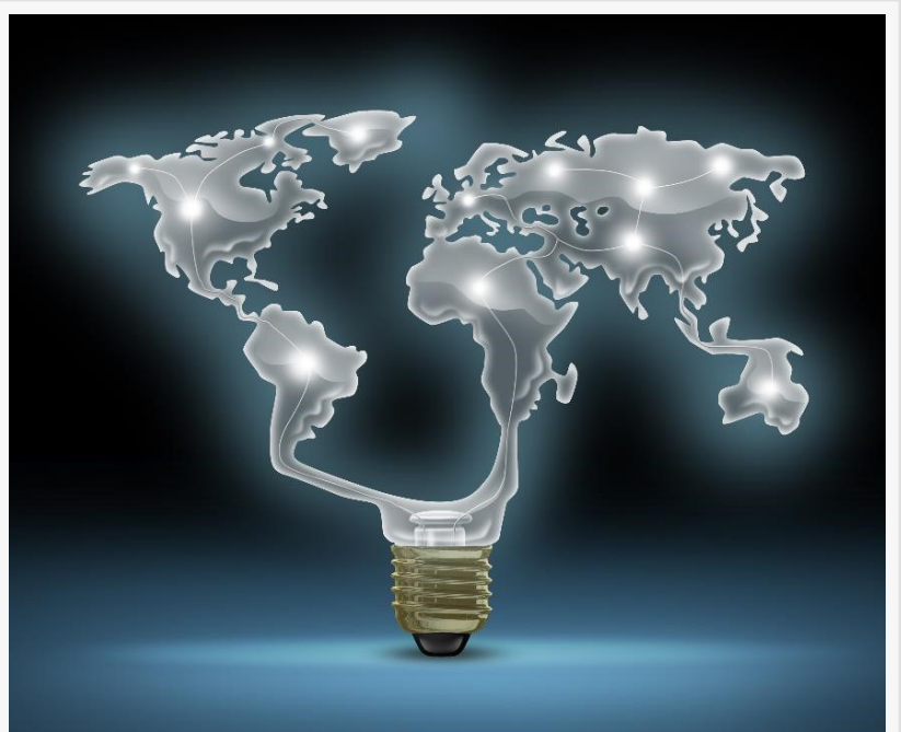
World class innovation - London September 11 2018

Teyneg are all about combining technology and business. They are a leading consultancy and technology services provider. Advances in Technologies are the principal key factors in the transformation of Business. Teyneg offers experience and solutions to create value in your business. Unifying the experiences and skills of our team, we help clients the capability to transform their business by providing outstanding outsourced IT solutions in mobility services, IT supply management, project management and power distribution.