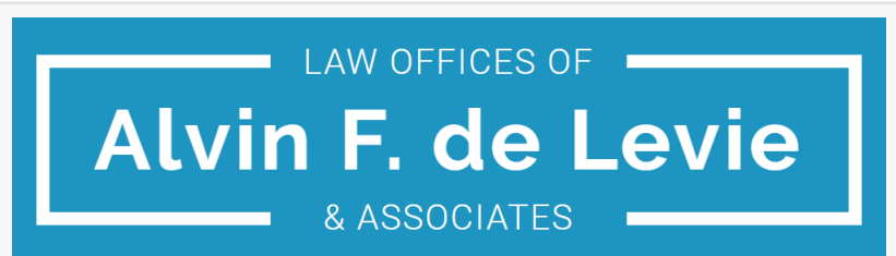
Alvin F. de Levie & Associates

All athletes will compete in a variety of sporting events. These 14 different events include basketball, soccer, bowling, etc. The main goal of the sporting events is to empower those with intellectual disabilities as valued members of society. The Special Olympics continues to fight against stigmas