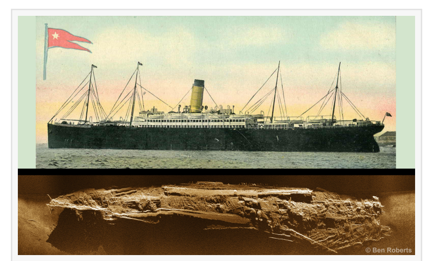
RMS Republic - Then and Now - Port

MIAMI BEACH, FL, UNITED STATES, March 4, 2025 /EINPresswire.com/ --Dubbed "modern day pirates" (in the romantic, complimentary sense) by a federal district court judge, the Lords of Fortune are setting out to capture the greatest prize in history: a cache of U.S. golden eagles trapped deep within the wreckage of one of history's great sunken White Star Line luxury liners. A team of attorneys, researchers, salvage professionals, and successful businessmen captain the group. Together, they are joining their skills, expertise, and resources to undertake the greatest treasure wreck salvage and recovery of all time.