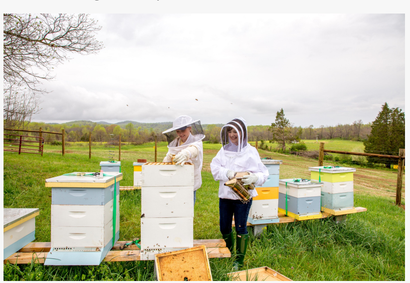
Apiary overlooking our field of wildflowers providing forage for pollinators

SBC's motto is 'she who earns the rose may bear it,' which led naturally to a name for the rosé. Leading the Way Chardonnay celebrates our women's leadership core curriculum and history of preparing our students for leadership roles after graduation, and Meadow Merlot honors the College's conservation and stewardship efforts, as those grapes were grown in a tract overlooking our field of wildflowers providing forage for pollinators."