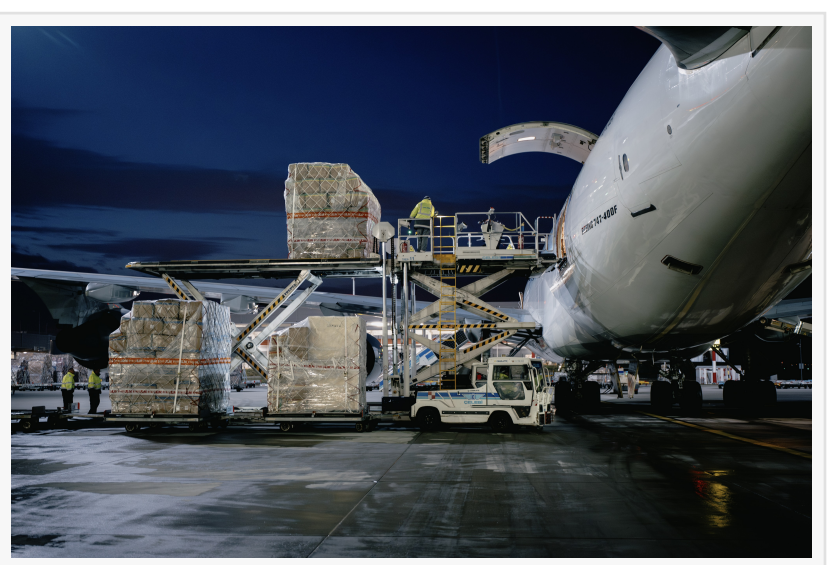
Celebi Aviation Budapest Operations

With more than 65 years of ground handling experience on three continents, in six countries and at 70 stations across the world, Çelebi Aviation continues to improve its operations. In February 2024, Çelebi Aviation Hungary took a transformative