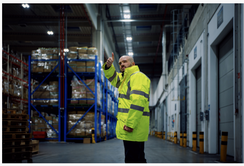
Celebi Aviation Budapest

step by taking over a dedicated 3,500 sqm expansion area for further growth of its warehouse operations in Cargo City. This was complemented by a 2,000 sqm expansion of its non-covered manipulation area, significantly enhancing the capacity to manage peak freighter operations, preventing backlogs and ensuring seamless cargo flow.