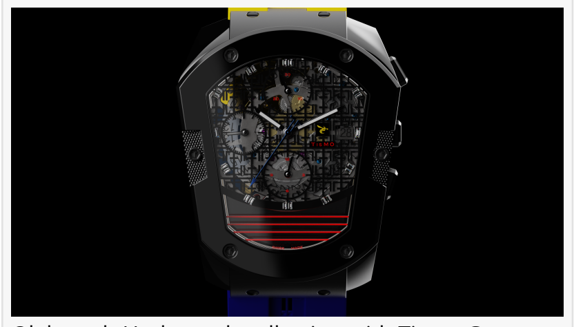
Oleksandr Usyk watch collection with Tismo Geneve