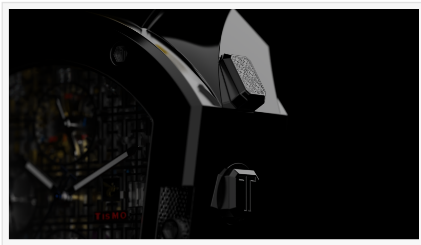
Oleksandr Usyk watch collection with Tismo Geneve

Adding to its exclusivity, each watch includes a pair of dedicated, signed Oleksandr Usyk gloves, specially created for this collaboration. Additionally, the watch loop straps are crafted from Usyk's training gloves, worn during his preparations for his first fight against Tyson Fury. Each