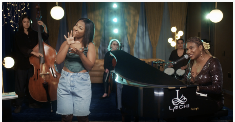
Behind-the-scenes of 'Diseducation' by Lachi