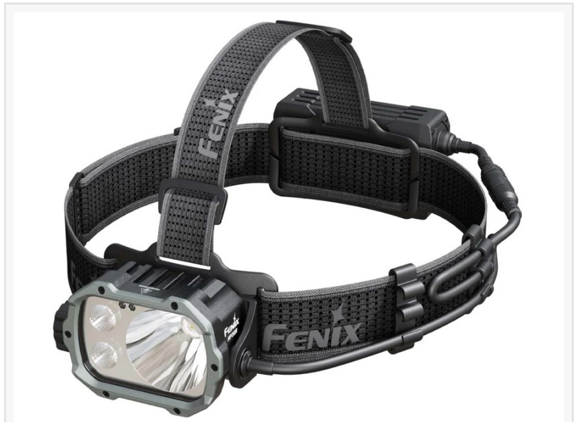
HP35R Standard Edition

*Professional-Grade Durability: Built to withstand the rigors of industrial environments, the HP35R features impact resistance up to 2 meters and an IP66 rating, making it