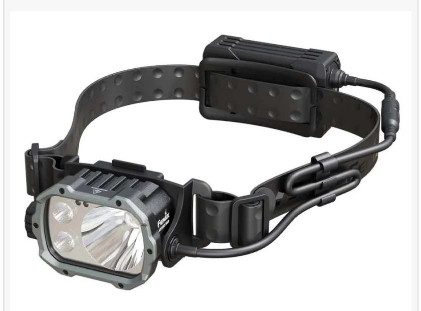
Fenix HP35R Search and Rescue Edition